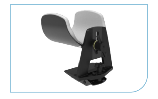
Compact design for improved imaging access