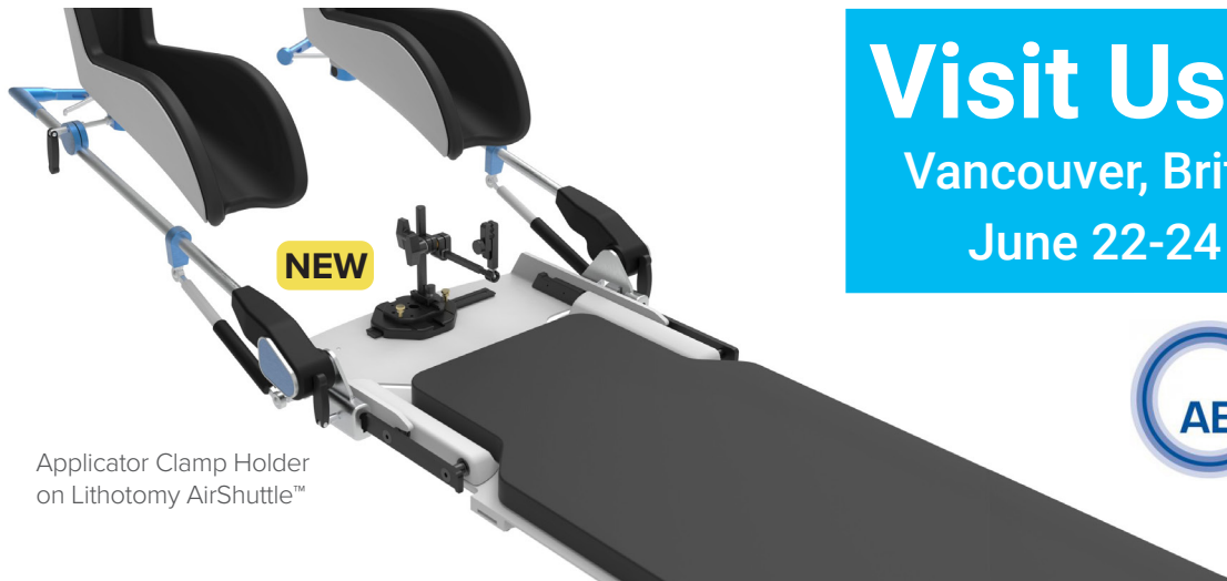
Applicator Clamp Holder on Lithotomy AirShuttle™