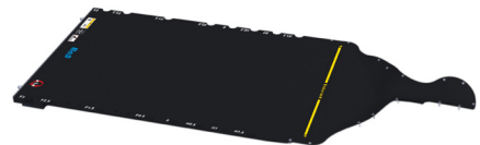
kVue™ BoS™ Insert RT-4535KV

* For more information on other kVue™ Inserts and thermoplastics available go to www.Qfix.com or call for details.