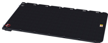
kVue™ Short Insert RT-4551KV2