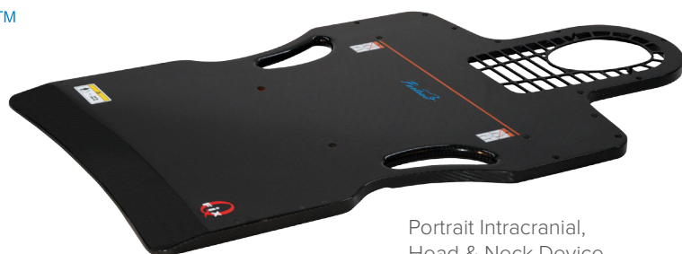
Portrait Intracranial, Head & Neck Device RT-4552